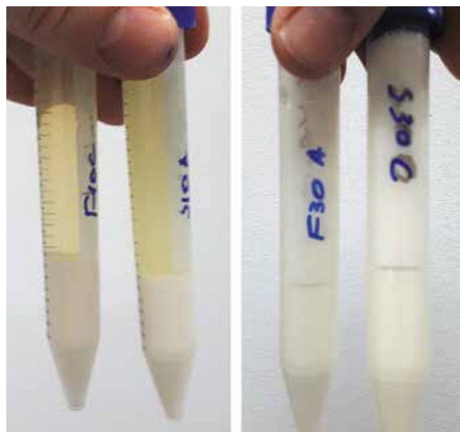
Figure 4: Sedimentation after centrifugation demonstrates that milk stored at -30^{\circ}\text{C} (right) is more stable than milk stored at -10^{\circ}\text{C} (left)

Consequently, the thawed milk becomes unsuitable for uses such as liquid milk, UHT or drying as powder or formula. Previous research, and current trials at MU demonstrate that the quality of freeze-thawed