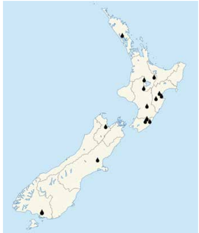
Locations of New Zealand sheep dairy farms

The key focus of the work being undertaken by GNS is the development of icephobic surfaces, i.e. surfaces with a low-ice-adhesion. The